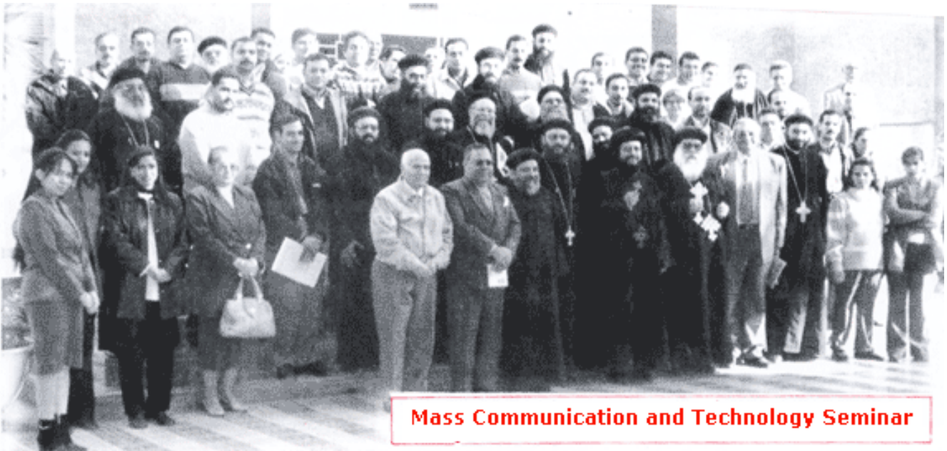
Mass Communication and Technology Seminar